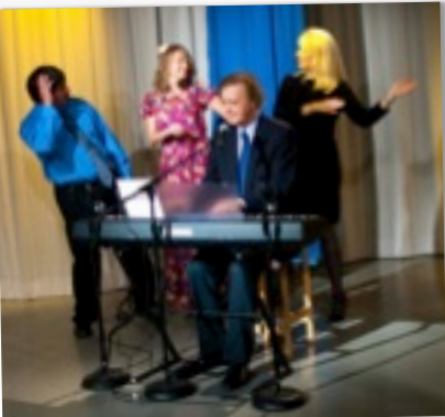
BAY TO BAY TOASTMASTERS OCTOBER 2011