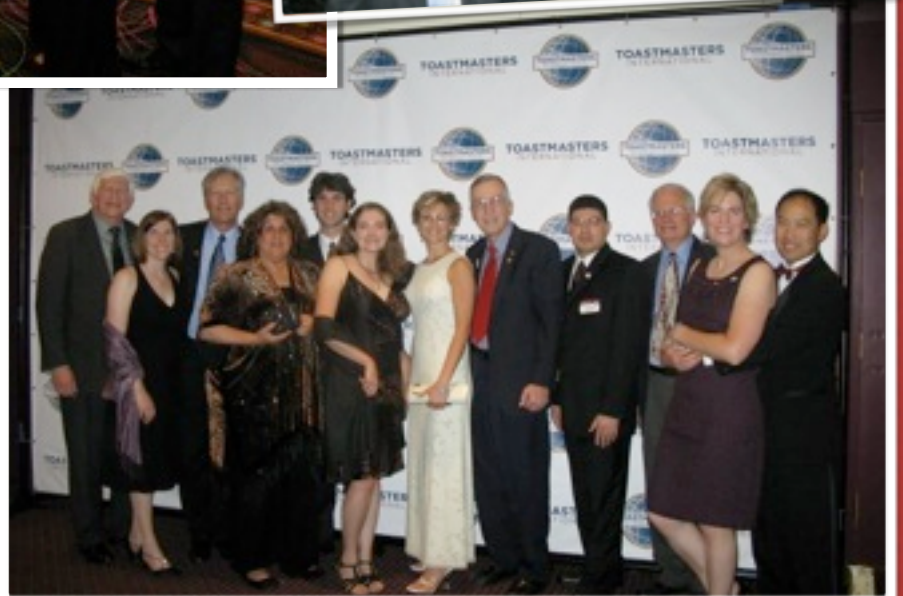
RIGHT - TOASTMASTERS FROM DISTRICT 4 BEFORE THE CELEBRATION OF BELONGING TO DISTRICT 4 - DISTINGUISHED 3 TIMES IN A ROW!