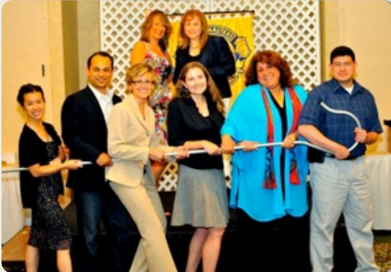
THE RECOGNITION LUNCHEON, JULY 30 2011. DISTRICT 4 IS DISTINGUISHED 3 YEARS IN A ROW.