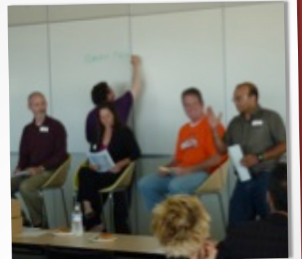
DIVISION C LEADERS