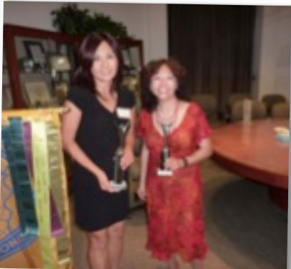
AREA B1 SPEECH CONTEST